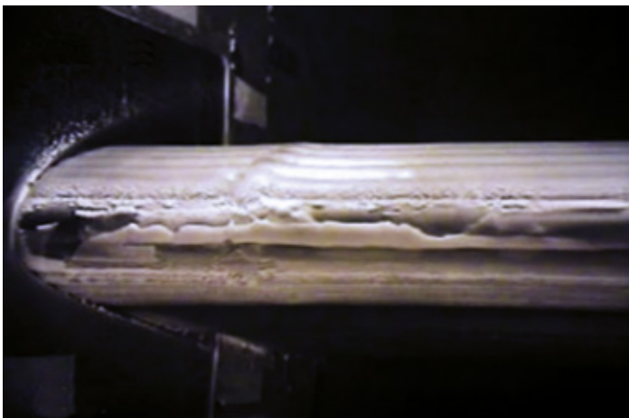
Fully tested in our icing wind tunnel and field proven.

Collins Aerospace is the manufacturer of Goodrich® pneumatic de-icing boots, providing dependable ice protection on thousands of aircraft worldwide. Our Goodrich SILVERboot™ pneumatic de-icers are ideal for maintaining an aircraft's premium appearance.